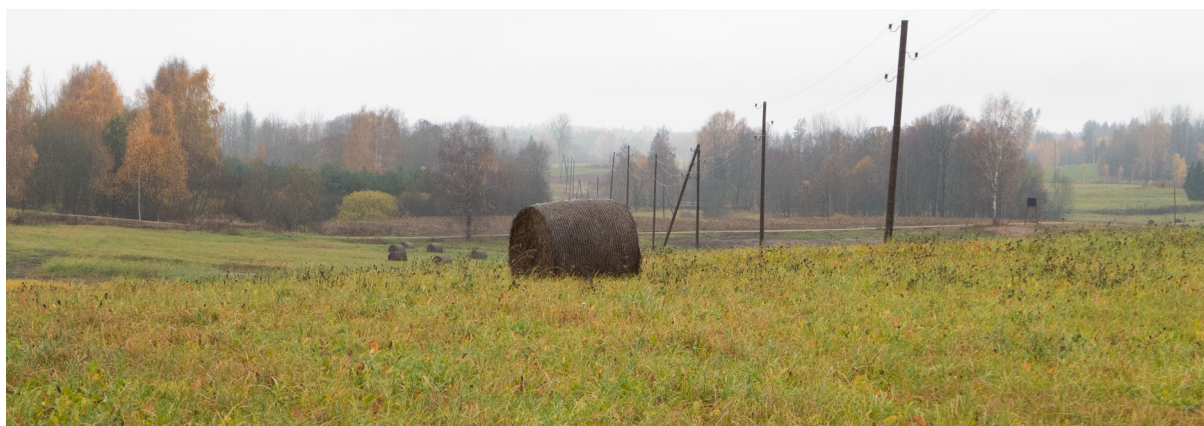
Figure 2 Latvian grass production