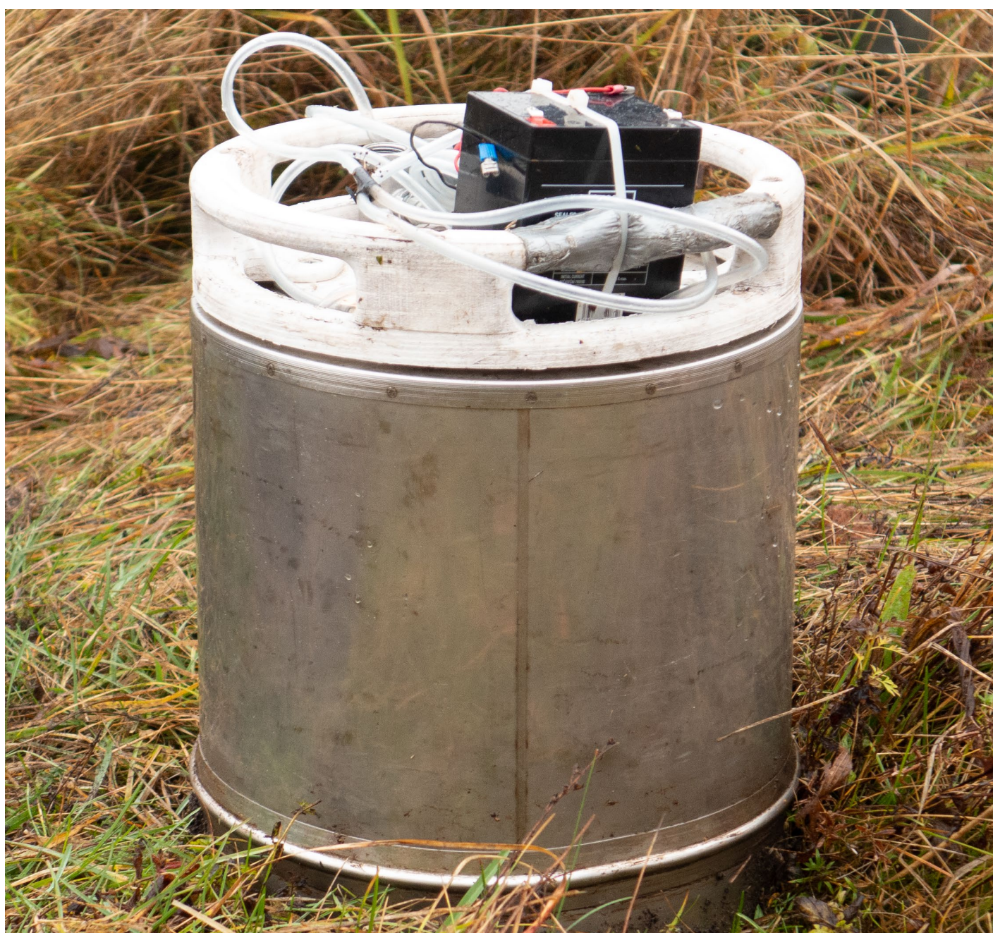
Front cover photo: Soil experts studying a soil profile

NIBIO is owned by the Ministry of Agriculture and Food as an administrative agency with special authorization and its own board. The main office is located at Ås. The Institute has several regional divisions and a branch office in Oslo.