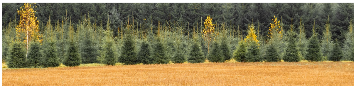
Figure 6 Latvian agricultural field